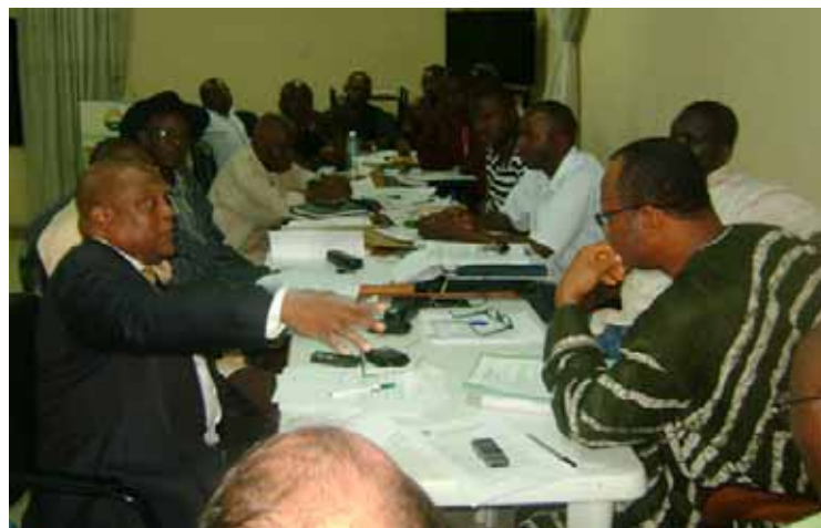
Photo News: NSE PH Branch EXCO members in October 2011 meeting