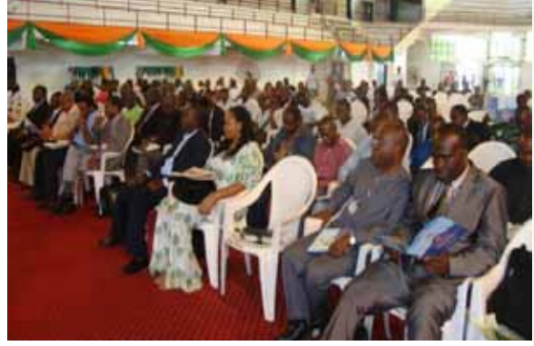
A cross section of mechanical engineers during the NiMechE International Conference in Port Harcourt.